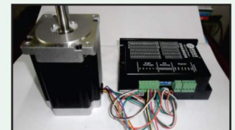
Double Leisai Brushless Servo Motor Know transmission stability and Safety