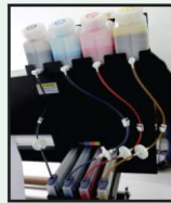
Continue Ink system CMYK 4 Ink Cartridge