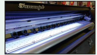
Japan THK rails and full aluminum structure Ensure the precision and used in testing parallelism straightness is 0.01mm

The parameters above are subject to change without notice