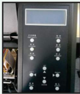
Menu Screen Easy and Powerful can do all setting in the menu