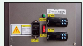
Heating system and suction adjustment Set the temperature & improve the printing quality