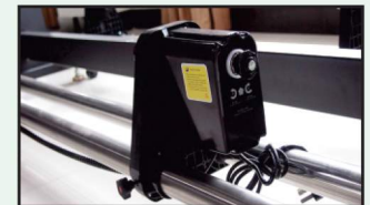
Auto winding and putting system Don't worry about printing long figure