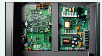
Best quality mainboard and headboard Best printing quality provide and stable, provides one year warranty